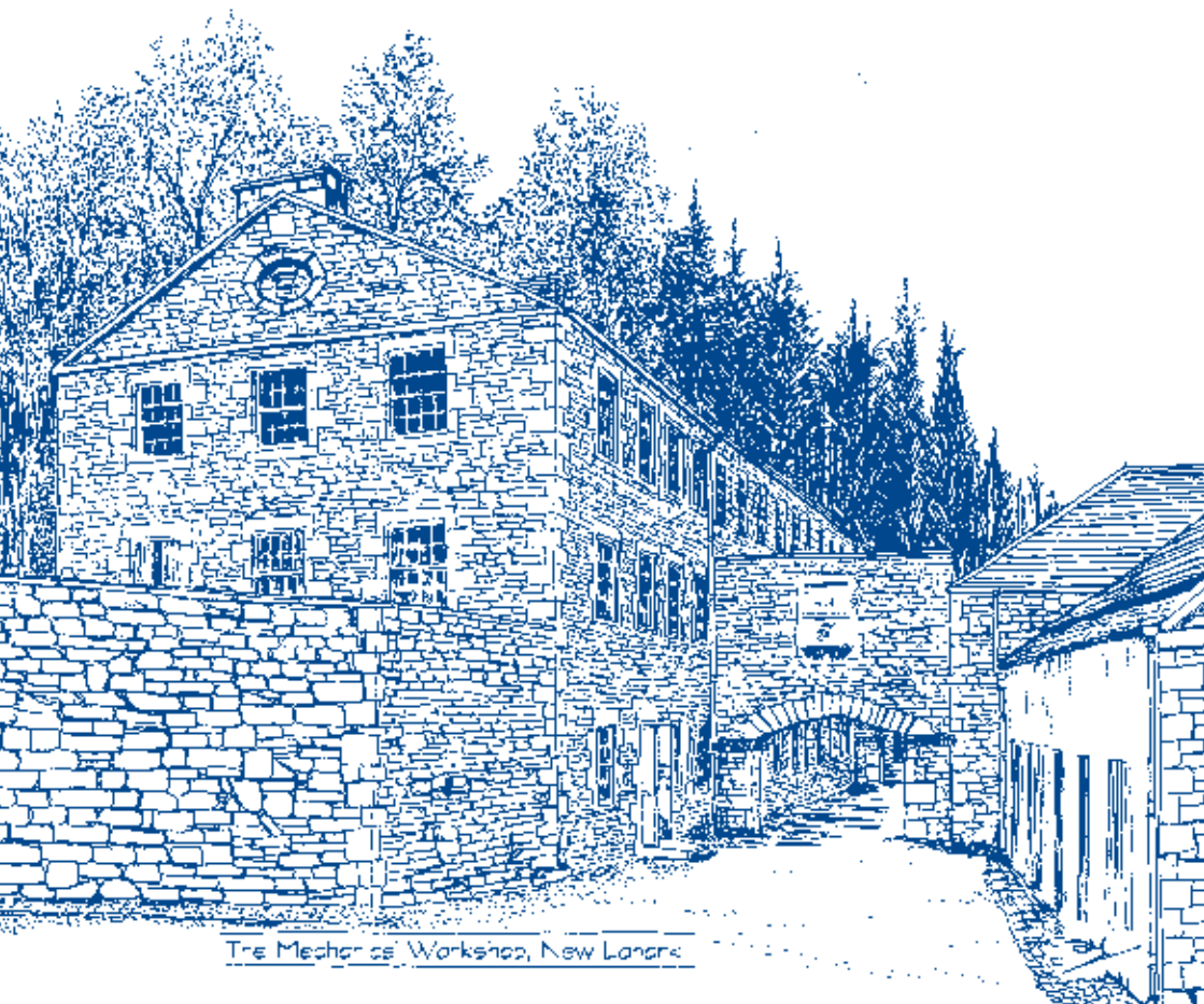
The Mechanics Workshop, New Lanark